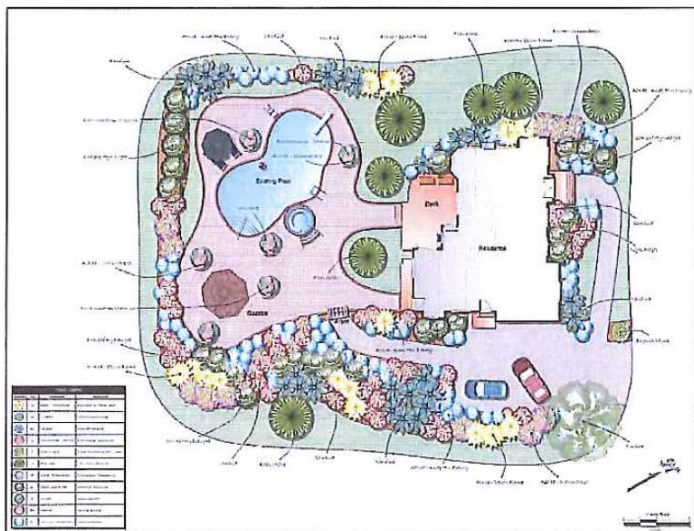
(Sample Landscape Plan)